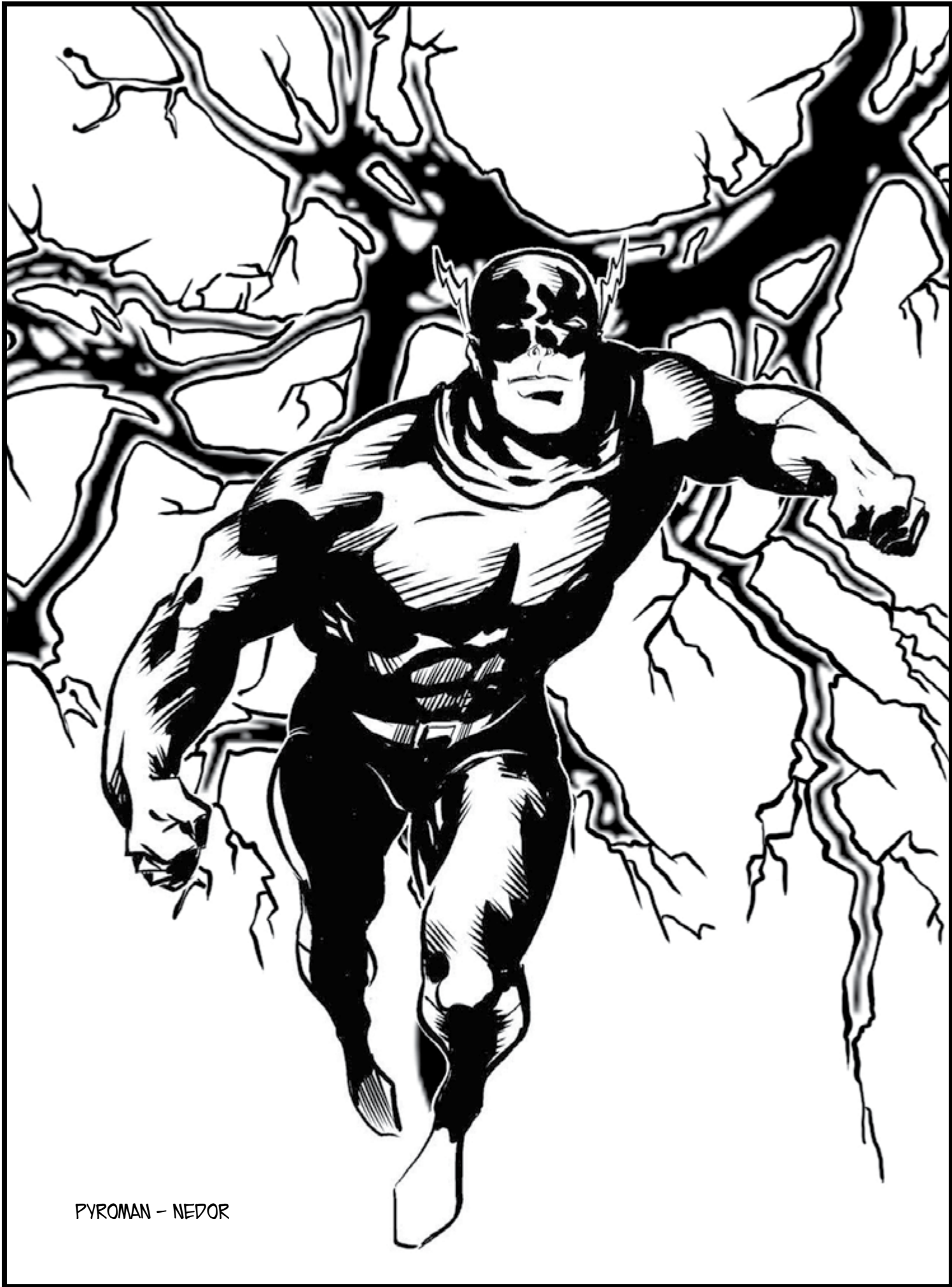
PYROMAN - NEDOR